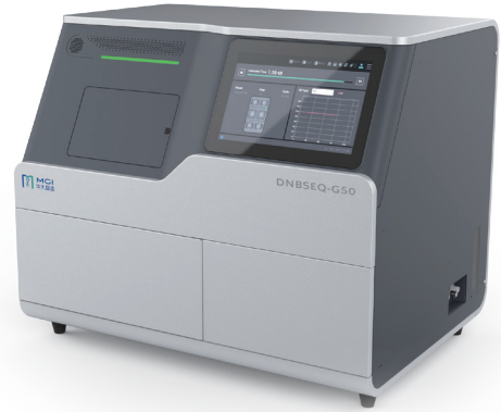
Figure 2. DNBSEQ-G50 high-throughput sequencer

Based on DNBSEQ-G50* (FIG. 2, Cat. NO. 900-000354-00) high-throughput sequencer, SE100 sequencing is carried out. The single-end sequencing can effectively detect the virus and shorten the time. We also provide DNBSEQ-G400* (Cat. No. 900-000170-00) and DNBSEQ-T7* (Cat. No. 900-000128-00) for instrument selection, and SE50 and PE100 for sequencing reads.