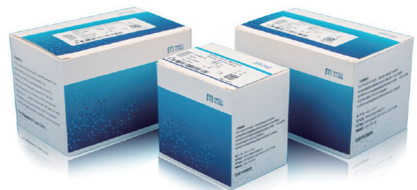
Figure 1. MGI Library Preparation Kits

MGIEasy FS DNA library prep set V2.0 (16 RXN, Cat. No. 1000005252) and MGIEasy RNA library prep set V3.0 (16 RXN, Cat. No. 1000006383) were used respectively to construct DNA and RNA library. And MGIEasy cyclization kit V2.0 (16 RXN, Cat. No. 1000005259) was used to cyclize the libraries. After the reaction, DNB was made according to the DNBSEQ-G50RS high-throughput sequencing set* (SE100, Cat. No. 1000019856) instructions (FIG. 1). These kits are all suitable for automation system MGISP-100 (MGI, Cat. No. 900-000051-00).